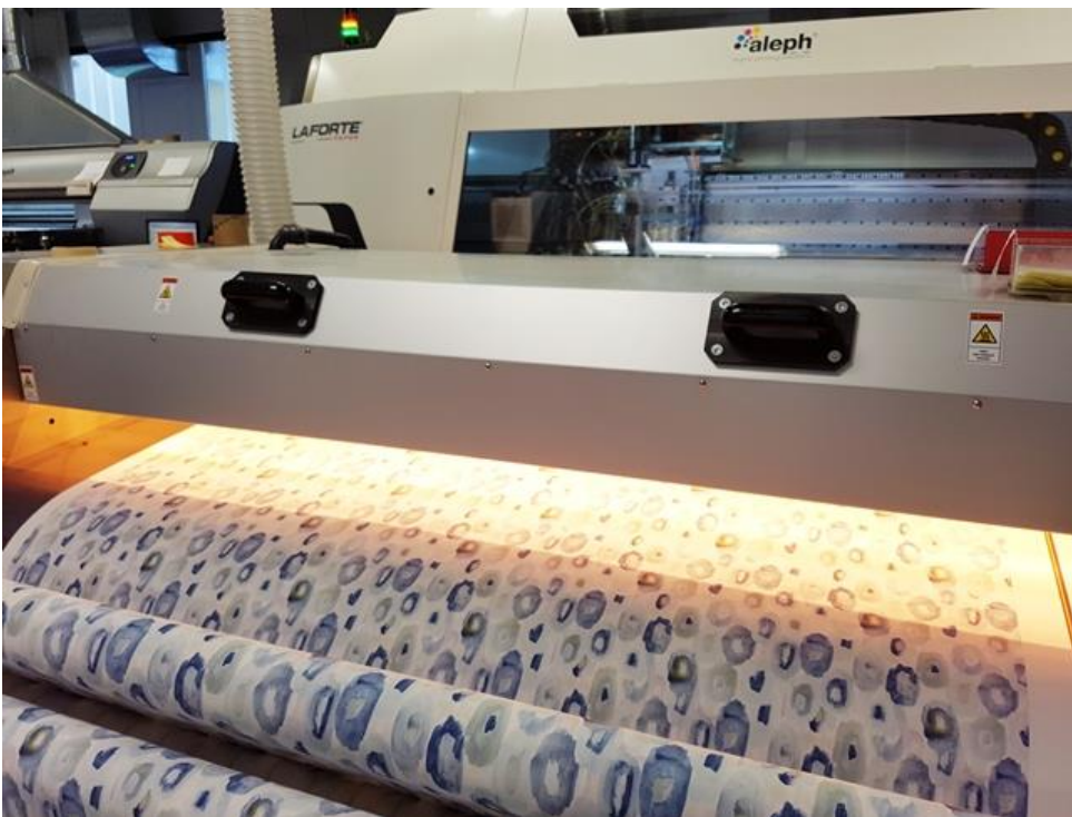
The wide format inkjet plotter LaForte® Paper in motion inside the Print Division at Silkomo.

Via Giotto 26 22075 Lurate Caccivio (Como – Italy) Tel. +39 031 575902 Fax: +39 031 3385098 info@alephteam.com