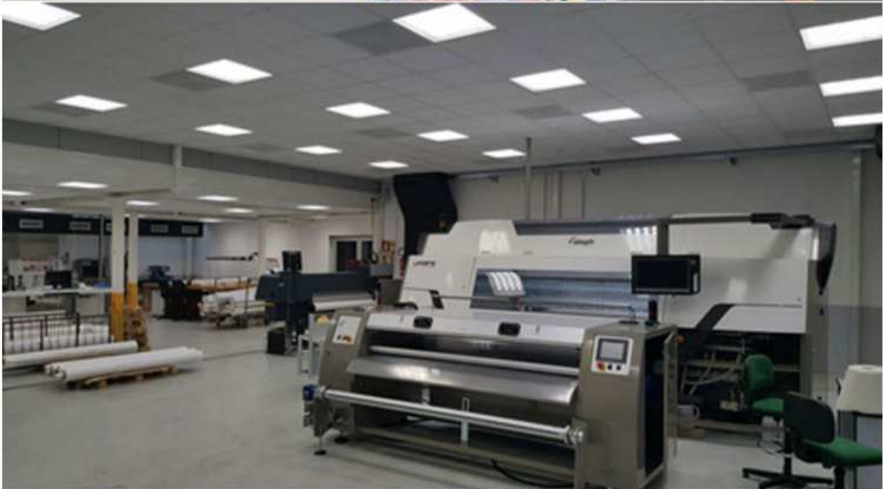
The digital printer of great LaForte® Paper format inside the production site of Tintoria e Stamperia di Lambrugo Spa

Aleph says this first installation is only the beginning of the development of the home Italian market for LaForte printers, while international prospects are being developed and it foresees the production of machines dedicated to emerging markets. It also plans to open an Aleph office in Istanbul, for the direct management of the Turkish and Indian markets.